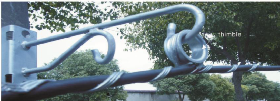
Helical armour rod