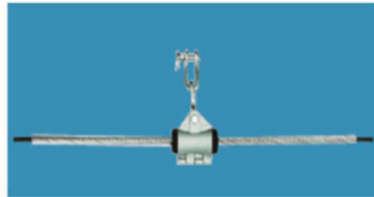
SAXD-150-XX suspension clamp